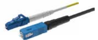
FUSION SPLICE-ON CONNECTORS